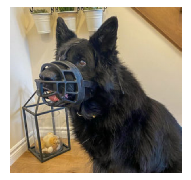
Kash is a retired police dog, modelling a basket muzzle. Peel Regional Police use a similar technique, but with clicker training, to acclimate their dogs to muzzles. It is incredibly important that they are comfortable wearing a muzzle in order to perform their high level training duties while wearing one, when needed.