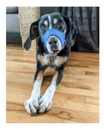
Sadie, patiently waiting in a down-stay for her treat, while muzzled

Don't advance the muzzle yourself, let your dog make the choice to advance their nose. 7) Then you can actually clip the muzzle behind their ears, feed a treat and take it off again. Let them place their nose through, clip, treat, remove. Do this over and over, very slowly increasing the length of time they keep it on. Initially it will be for 1 second, then 2-3, then 10, feeding treats the whole time.