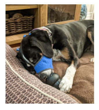
Building time with the muzzle on while licking peanut butter out of a Kong

9) The last step is to simply repeat muzzle application intermittently, maybe just for a few minutes each night, always assessing if it's causing any stress. Ultimately the goal is that they should actually enjoy wearing it or, at the very least, are indifferent to it, no different than their collar.